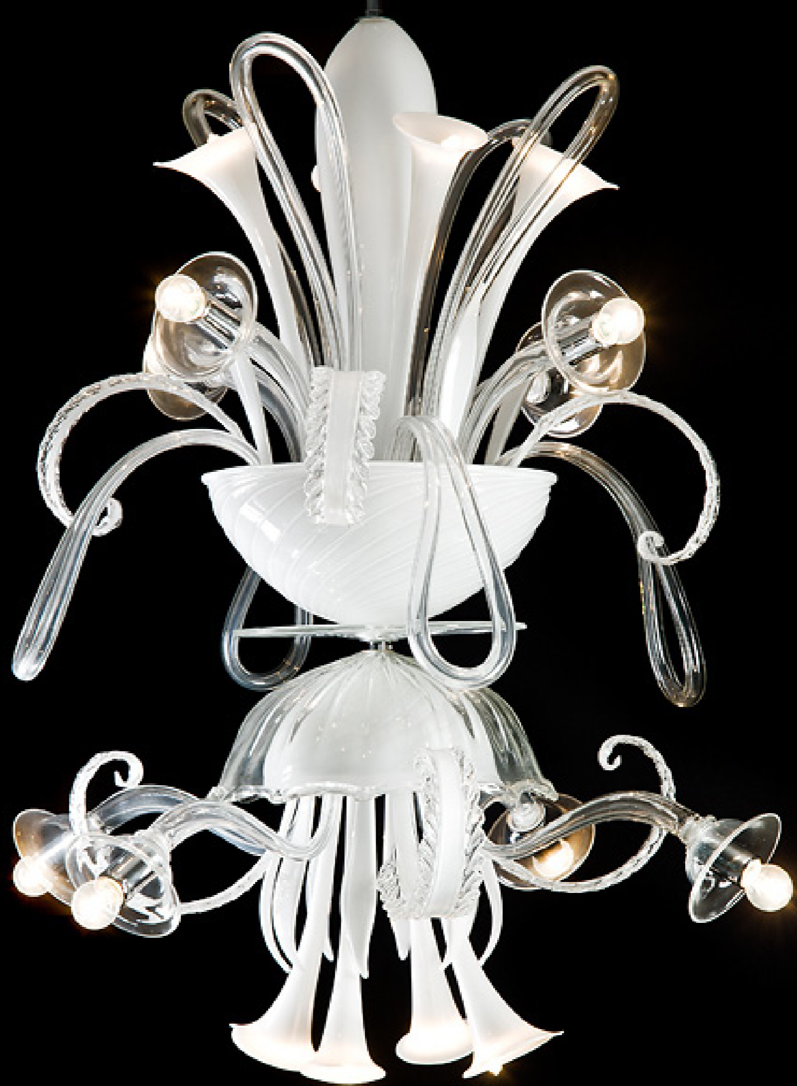
Nigel Coates Neo Mio