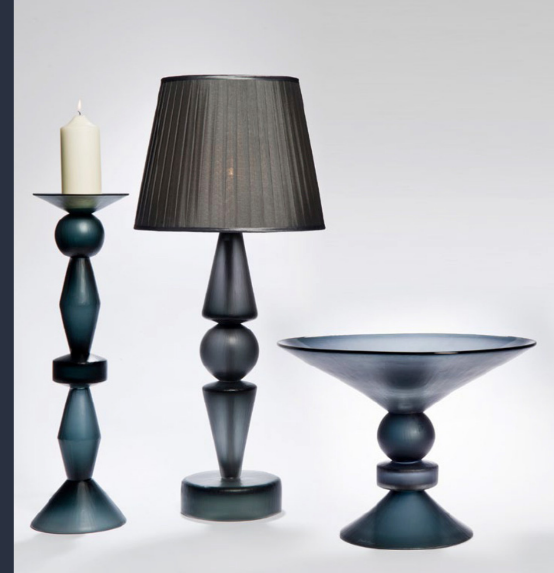
Simon Moore Balustrade Collection