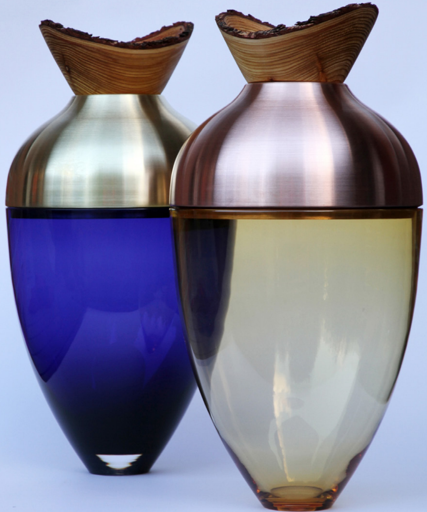
Pia Wustenberg Stacking Vessels