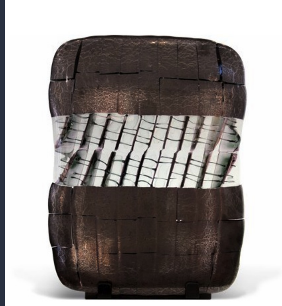
Lise Gonther Glass panels