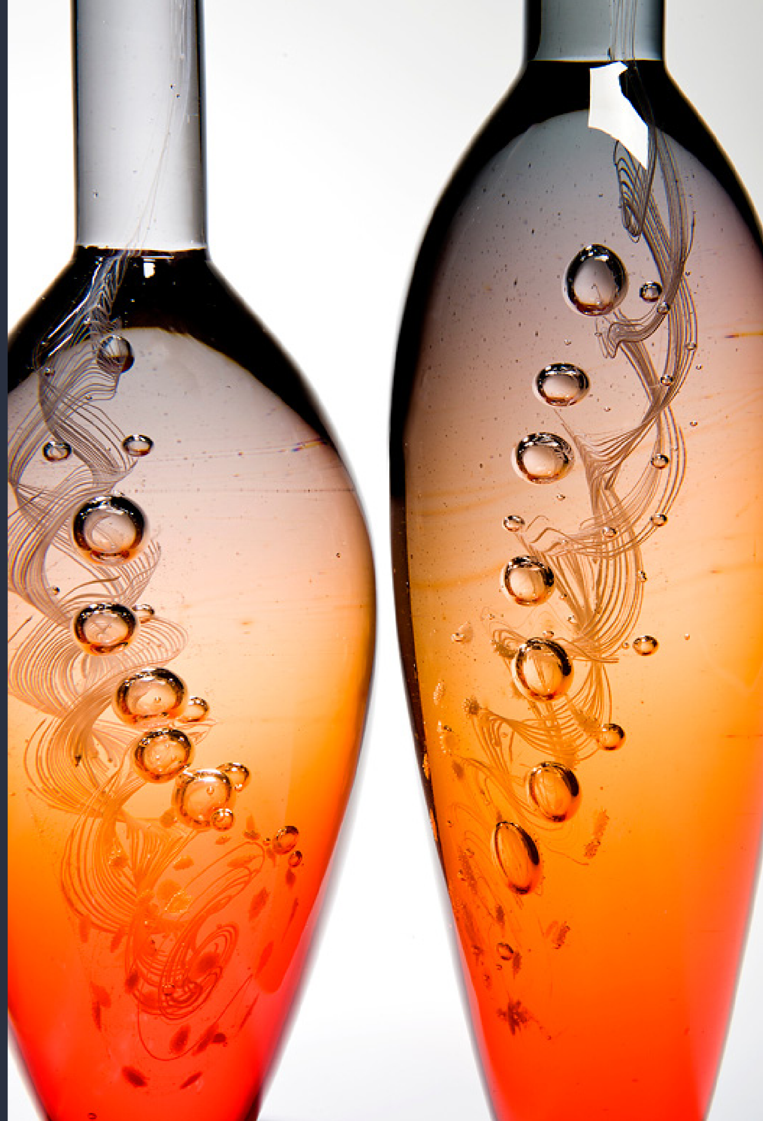
Louis Thompson System of DNA Markers Thermodynamic Hot