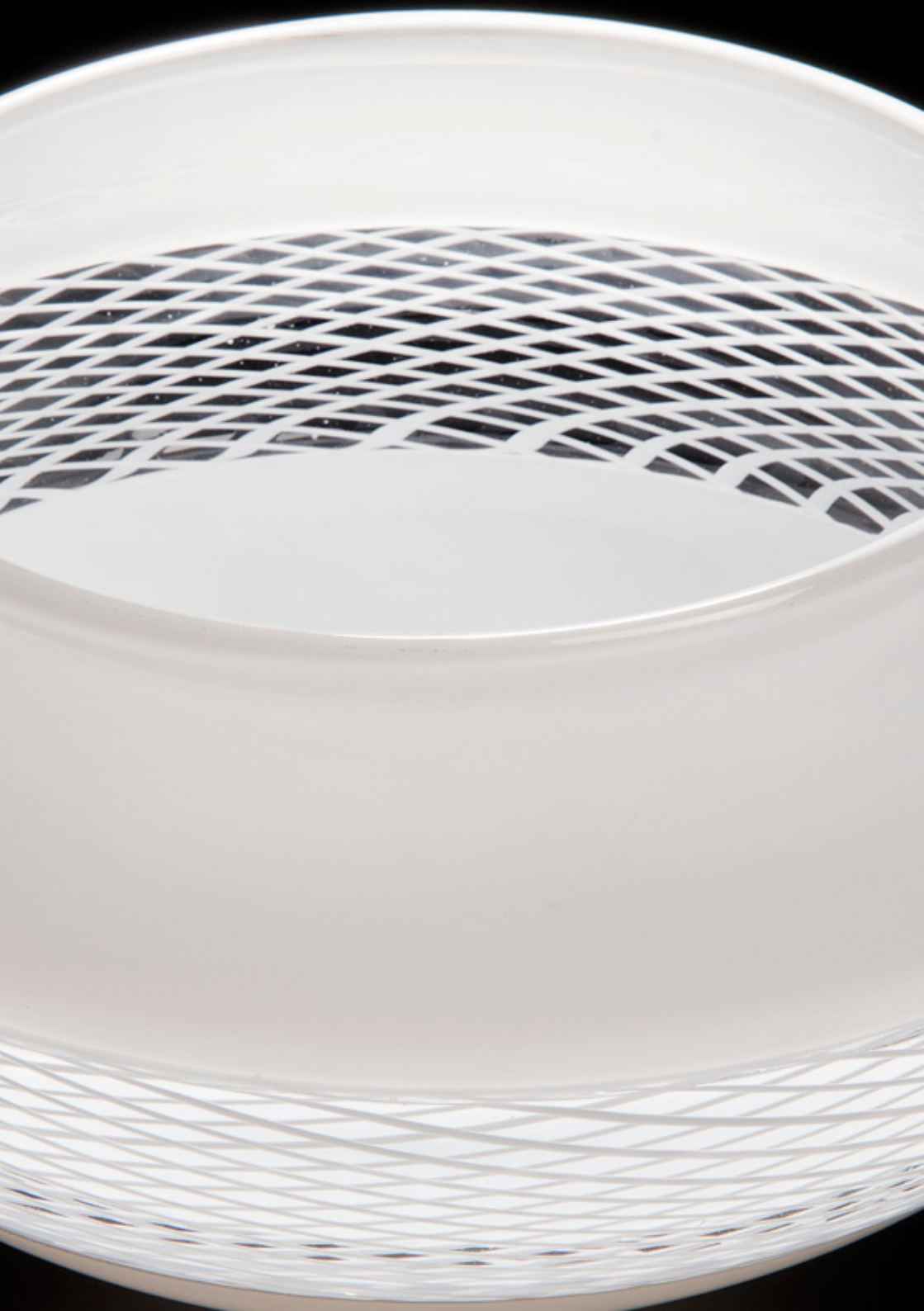
Trinity bowl in white 30cm diameter 17cm high