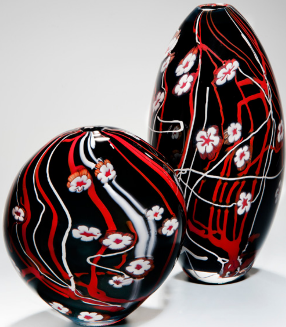
Japanese Flowers Tall vase 31cm high Round vase 20.5cm high