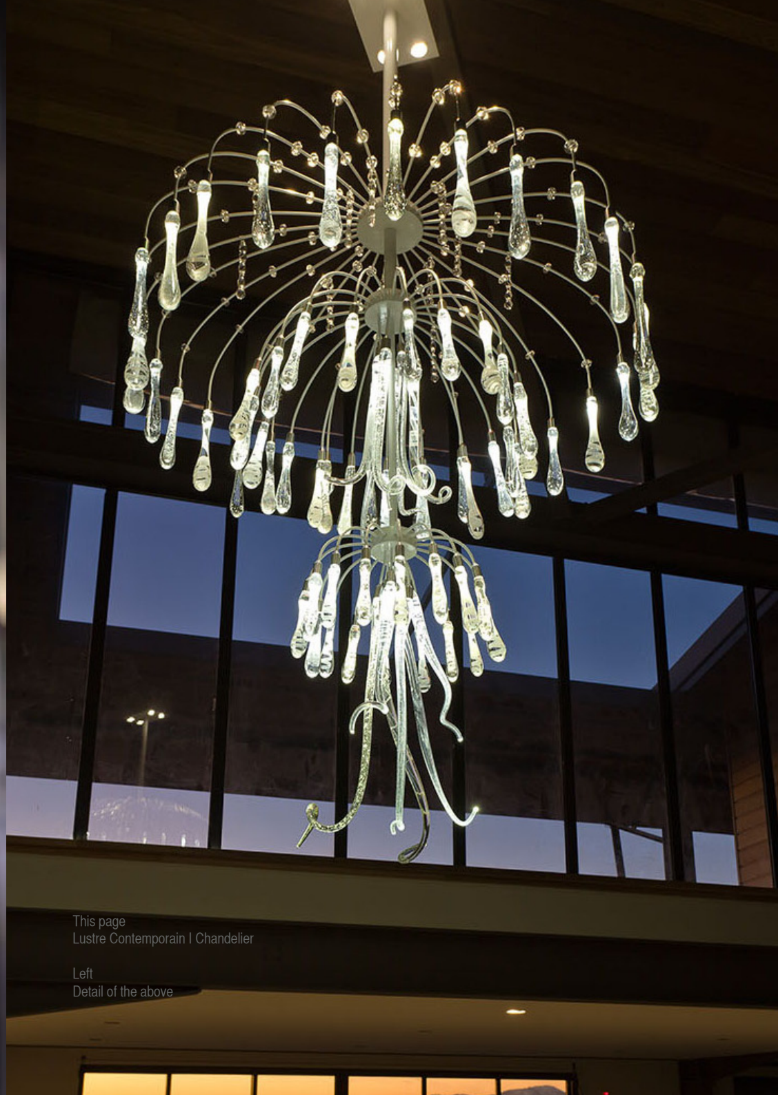
This page Lustre Contemporain I Chandelier