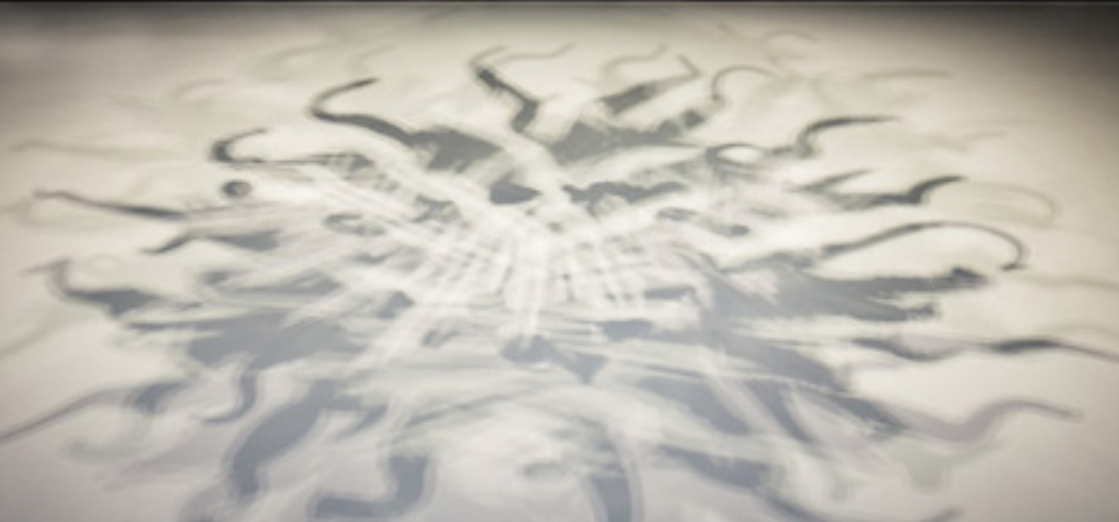
Left Lustre Contemporain II Chandelier