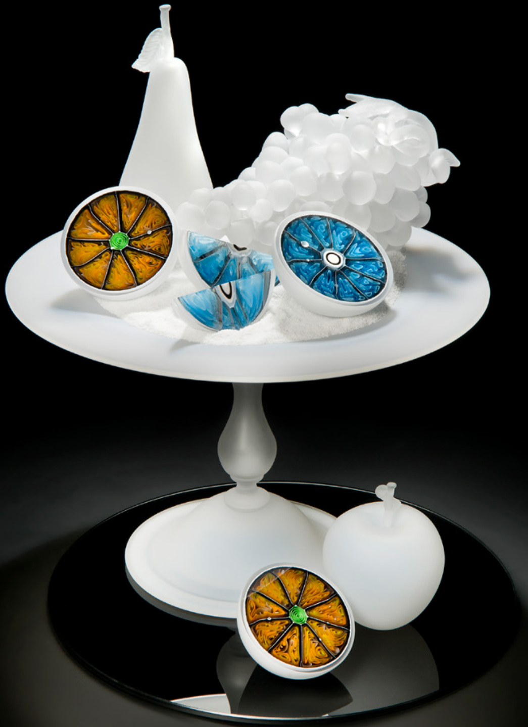
Perfect Bounty by Elliot Walker Unique 2019 Handblown & sculpted glass 43cm H, 42cm W, 36cm D