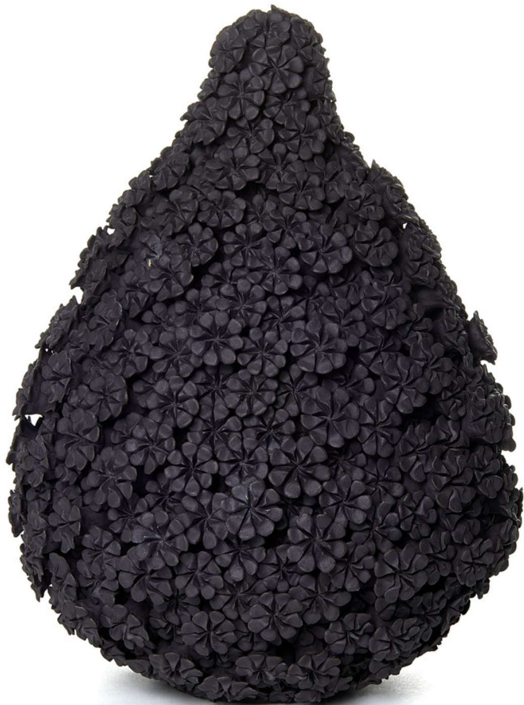
Daisy Teardrop by Vanessa Hogge Unique 2020 Black stoneware 39cm H, 33cm W, 33cm D