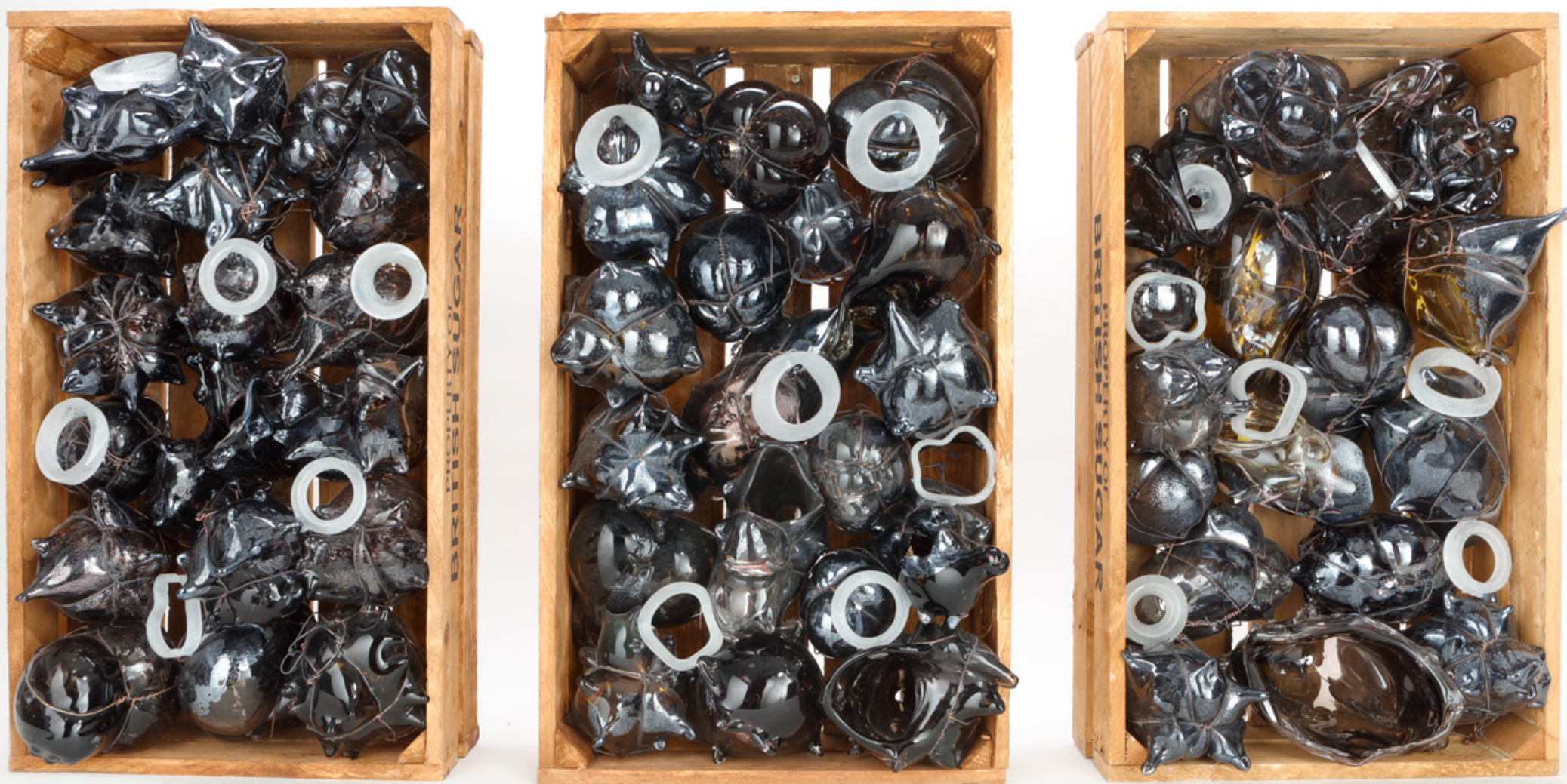
Commodity Triptych by Chris Day