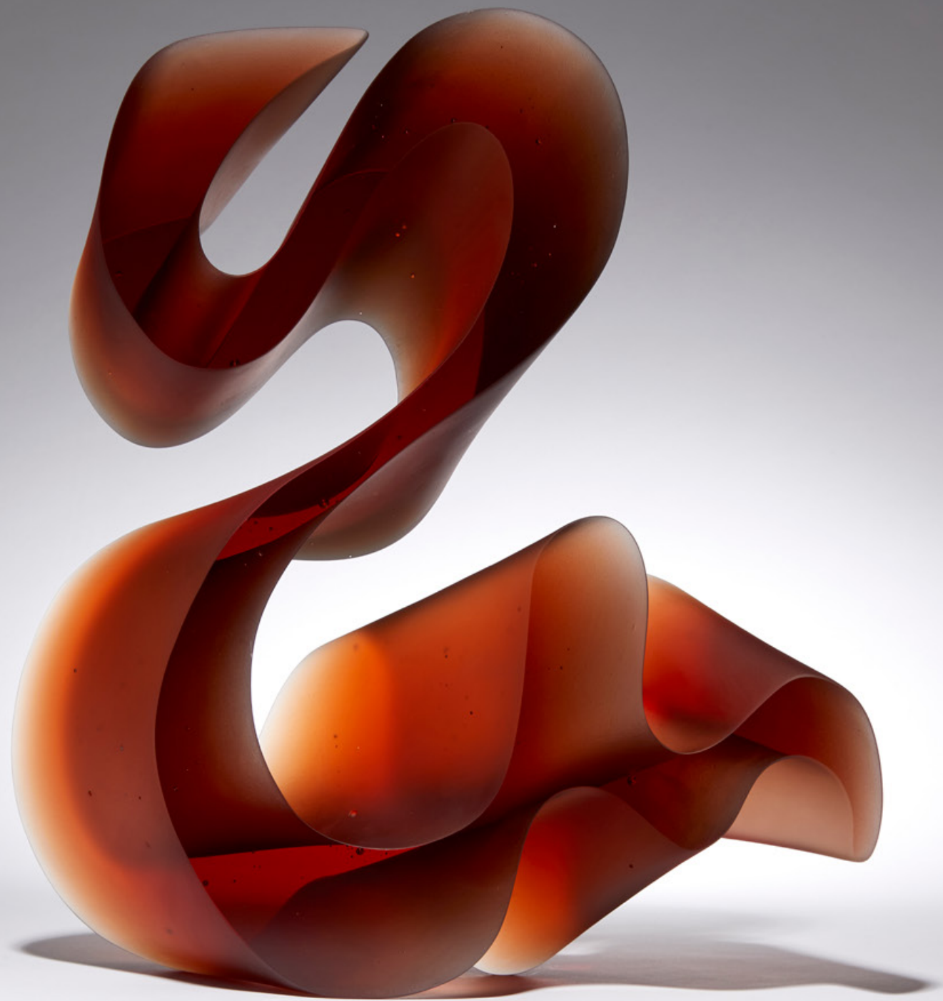
Big Reddish Line by Karin Mørch Unique 2021 Cast Glass 42cm H, 39cm W, 9.5cm D