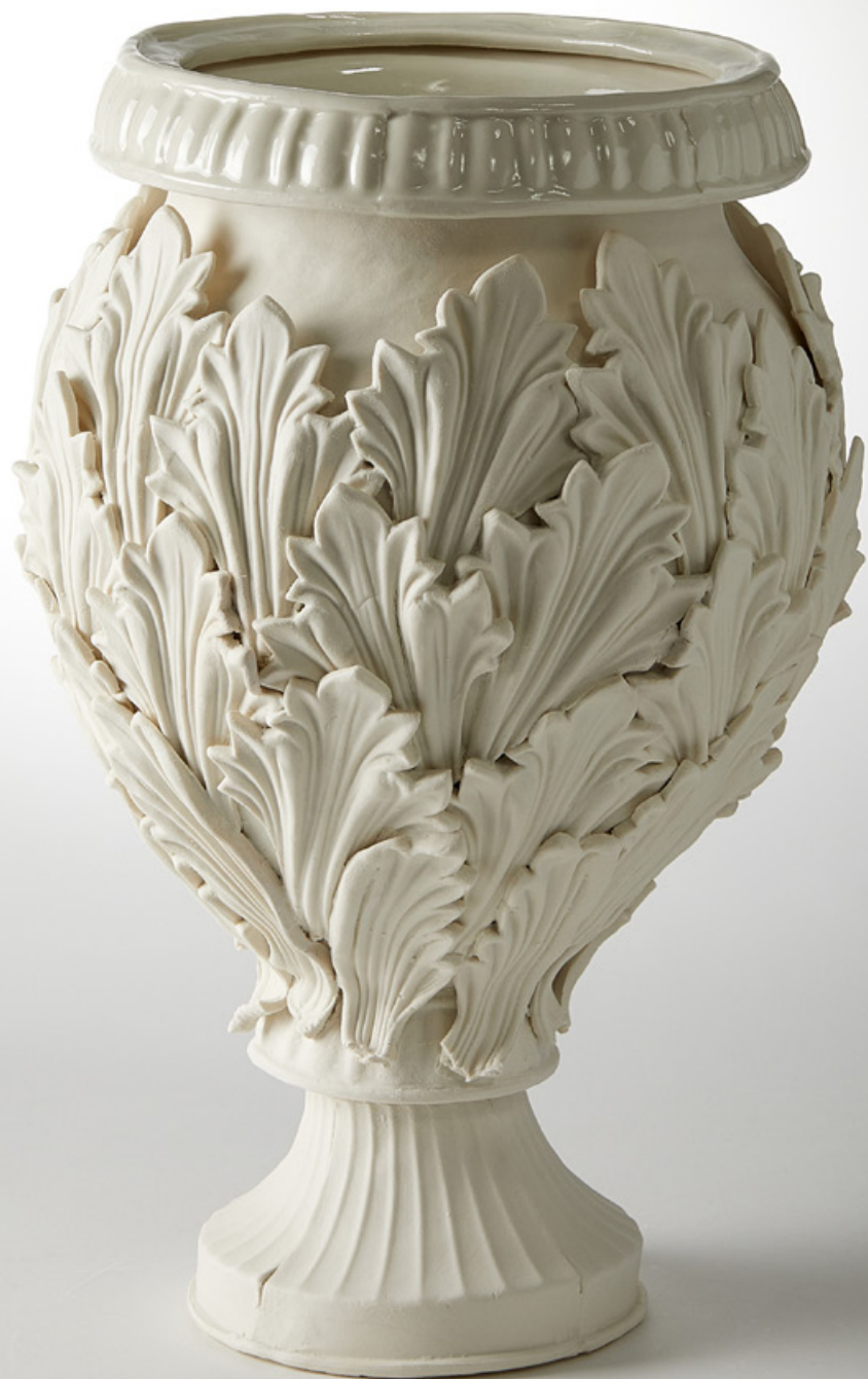
Acanthus I by Amy Hughes Unique 2020 Porcelain 43cm H, 28cm W, 28cm D